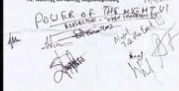
Power of the Night VI REFLECTION - When Immortals Die

Phivos Papadopoulos PITCH BLACK RECORDS / DIPHTHERIA